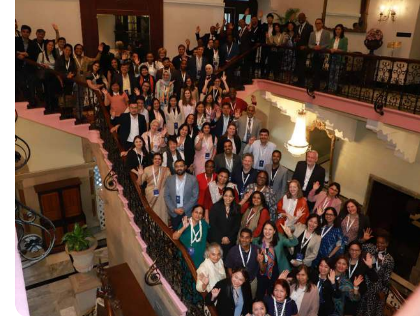
Photo: The 2023 Global Network Forum brought together 74 member representatives as part of Women's World Banking's Making Finance Work for Women Summit in Mumbai.

of Network Members participated in activities to drive advocacy and impact for women's financial inclusion.